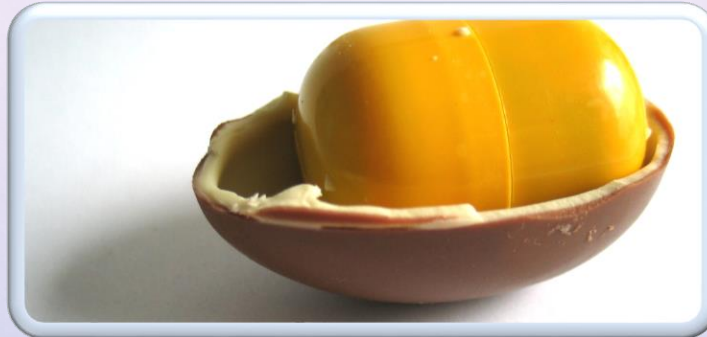
SHORT-TERM JOINT STAFF TRAINING EVENTS